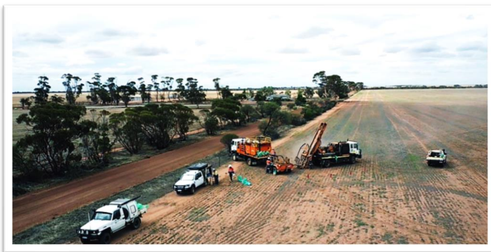
Figure 1: Aircore drilling at Crossroads prospect with 'Zero Impact Rig', Burracoppin Gold Project

Moho Resources Ltd (ASX:MOH) (Moho or Company) is pleased to announce the completion of the Company's first aircore drill program to follow up gold and arsenic anomalies on the Crossroads prospect at the Burracoppin gold project, located 22 km west of the Edna May gold mine in WA (Figure 2).