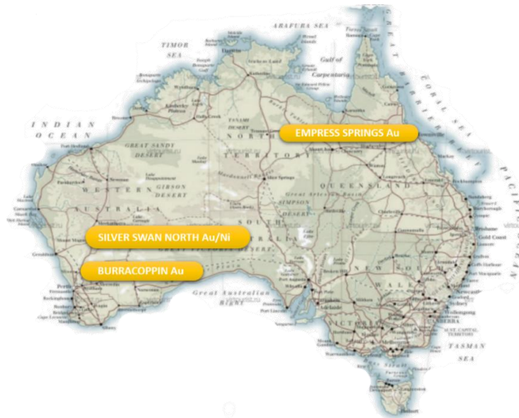
MAP OF MOHO's PROJECT AREAS

Moho Resources Ltd is an Australian mining company which listed on the ASX in November 2018. The Company is focused on gold and nickel exploration at Empress Springs, Silver Swan North and Burracoppin.