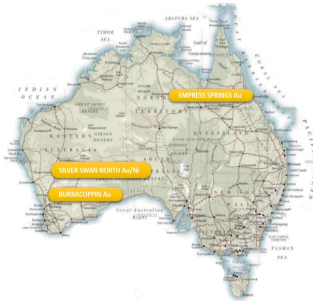
MAP OF MOHO's PROJECT AREAS

Moho Resources Ltd is an Australian mining company which listed on the ASX in November 2018. The Company is focused on gold and nickel exploration at Silver Swan North, Empress Springs, and Burracoppin.