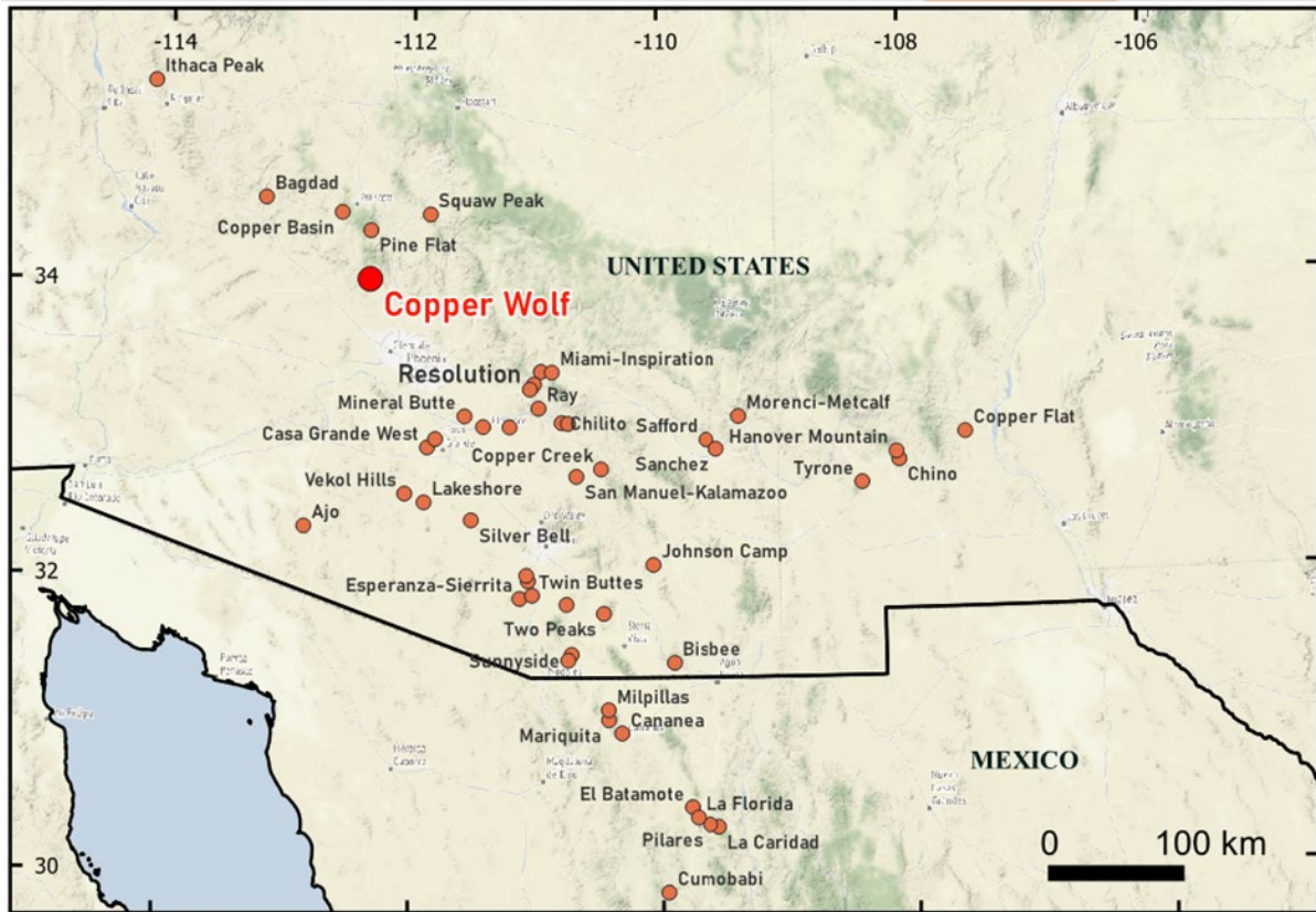
Figure 2: Buxton's Copper Wolf project is located in the prolific porphyry copper belt of SW USA / Northern Mexico - most of the porphyry Cu-Mo deposits marked are current or historical mines.